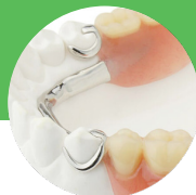
Metal Combo Partials